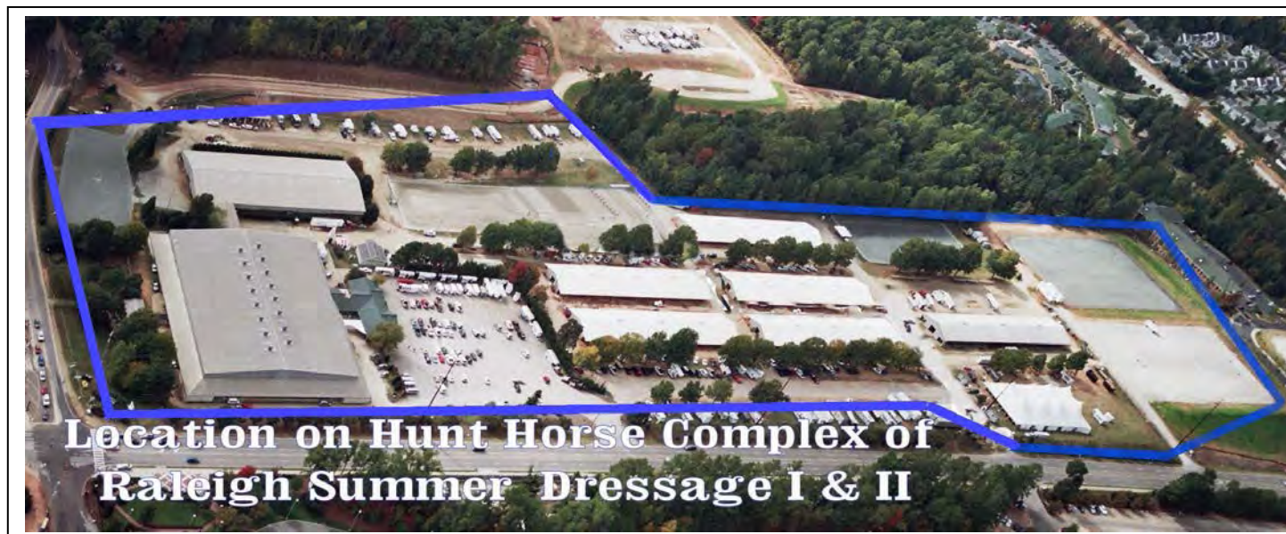
Location on Hunt Horse Complex of Raleigh Summer Dressage I & II

EVERY CLASS OFFERED HEREIN WHICH IS COVERED BY THE RULES AND SPECIFICATIONS OF THE CURRENT USEF RULE BOOK AND WILL BE CONDUCTED AND JUDGED IN ACCORDANCE THEREWITH.