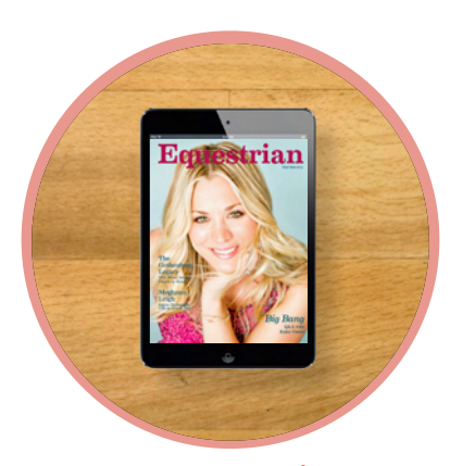
Equestrian The official magazine of the USEF

The national governing body for equestrian sport