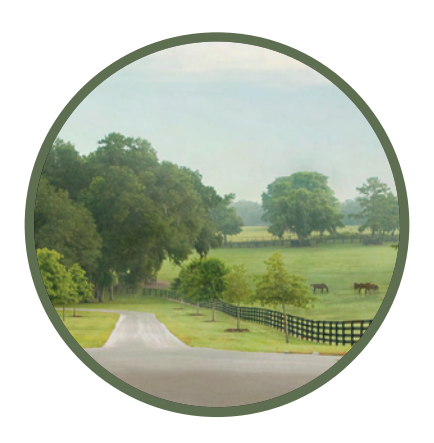
UNITED STATES EQUESTRIAN FEDERATION

The national governing body for equestrian sport