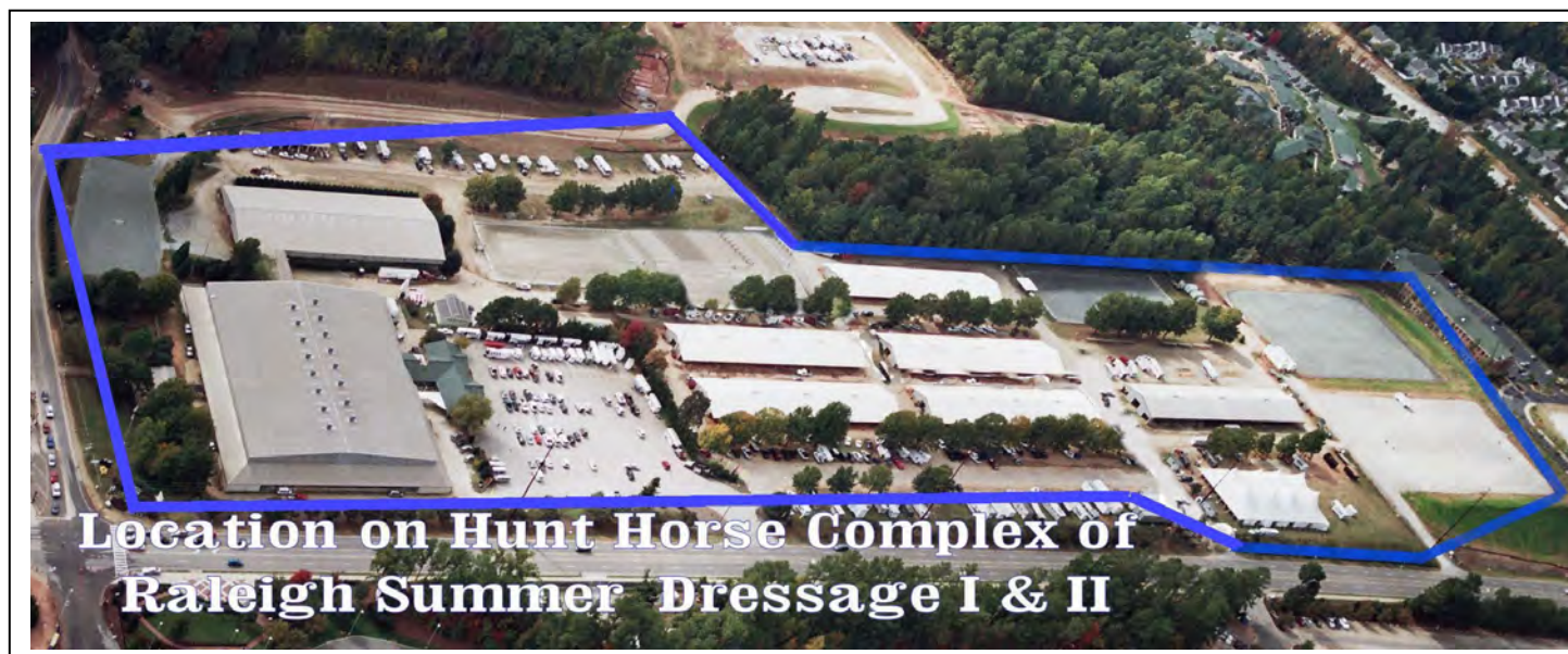
Location on Hunt Horse Complex of Raleigh Summer Dressage I & II

of The United States Equestrian Federation, Inc. (the "Federation") and the local rules of _____(Competition). I agree to be bound by the Bylaws and Rules of the Federation and of the competition. I will accept as final the decision of the Hearing Committee on any question arising under the Rules, and agree to release and hold harmless the competition, the Federation, their officials, directors and employees for any action taken under the Rules. I represent that I am eligible to enter and/or participate under the Rules, and every horse I am entering is eligible as entered. I also agree that as a condition of and in consideration of acceptance of entry, the Federation and/or the Competition may use or assign photographs, videos, audios, cable-casts, broadcasts, internet, film, new media or other likenesses of me and my horse taken during the course of the competition for the promotion, coverage or benefit of the competition, sport, or the Federation. Those likenesses shall not be used to advertise a product and they may not be used in such a way as to jeopardize amateur status. I hereby expressly and irrevocably waive and release any rights in connection with such use, including any claim to compensation, invasion of privacy, right of publicity, or to misappropriation. The construction and application of Federation rules are governed by the laws of the State of New York, and any action instituted against the Federation must be filed in New York State. See GR908.4.